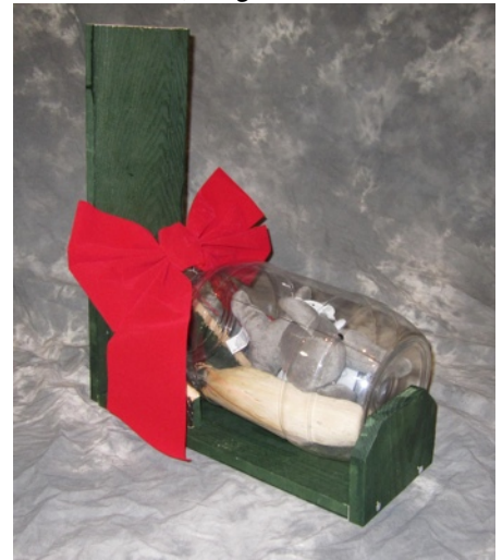
Keith Rosche, Squirrel/Elephant Feeder

Larger photographs of some projects are available at our online gallery .