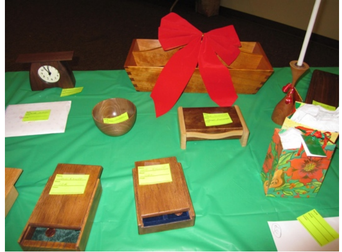
A sampling of the holiday gifts

We held the traditional gift swap, and there were plenty of gifts, thanks to those who brought more than one gift. There were a lot of wonderful gifts. It was great to see so much talent and generosity.