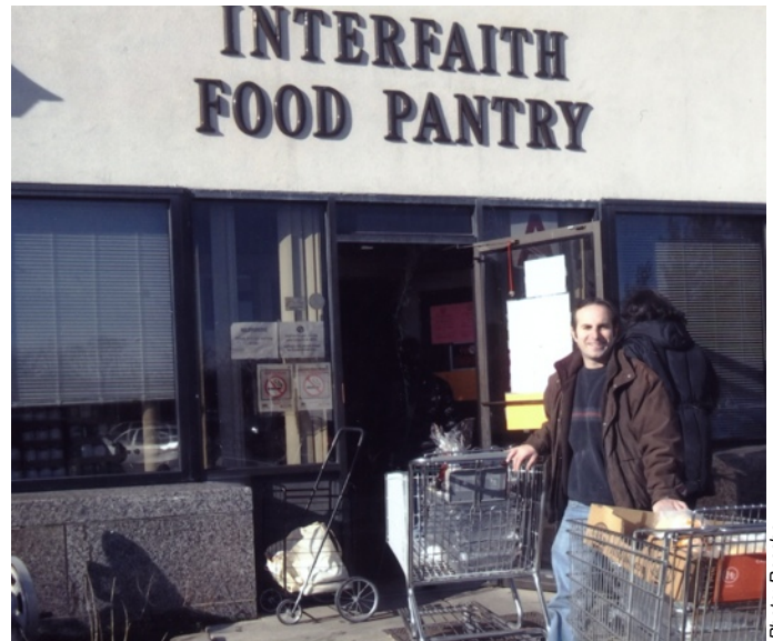
Volunteer worker at the food pantry