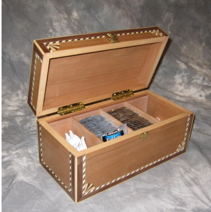
Lee Nye, Tea Caddy

A lot of projects that might have otherwise been on the “Show” table were on the gift table so the From Our Workshop section is fairly small this month.