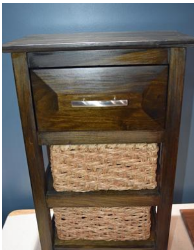
Sewing Stand - Obrian Parks Poplar - Dye