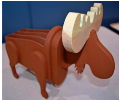
Moose - Tom Olson Pine - Paint