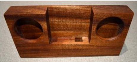
Cell Phone Amplifier - Zack Belzer African Mahogany - Tung Oil