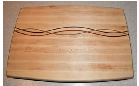
Cutting Board - Wayne Maier Maple & Misc - Mineral Oil