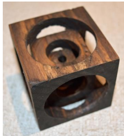
Paper Weight - Bob Bakshis Pine - Poly