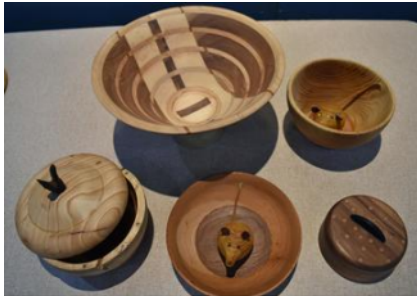
Bowls, Boxes & Mice Bert LeLoup Walnut, Osage Orange - Deft