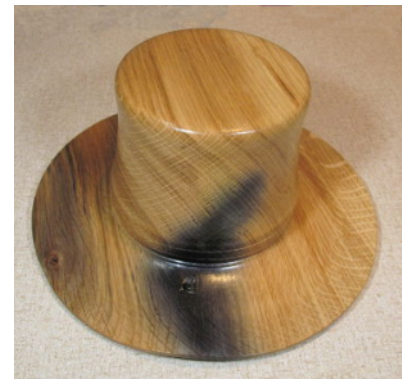
Turned Hat - George Rogers Oak - Lacquer