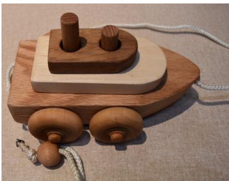
Puzzle Pull Toy - Paul Kricensky Oak, Maple, and Walnut - B.L.O.