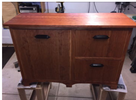
Master Bath Cabinet - Mike Perry Cherry - Watco Cherry