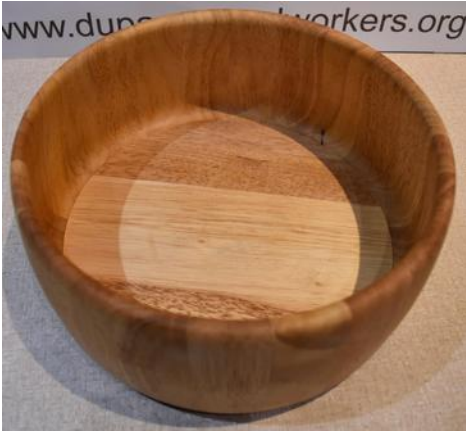
Bowl - Bert Le Loup Oak - Butchers Wax