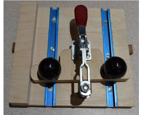
Cut-off sled - Roy Galbreath Plywood