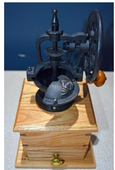
Coffee Grinder - Tom Olson Oak with Walnut Splines - Poly