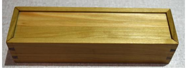
Dovetailed Box - Jim Harvey Poplar - Watco & Wax