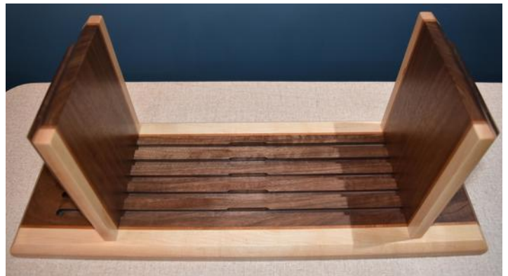
Sliding Dovetail Bookstand - Mike Kalscheur Walnut, Cherry, and Maple - Poly