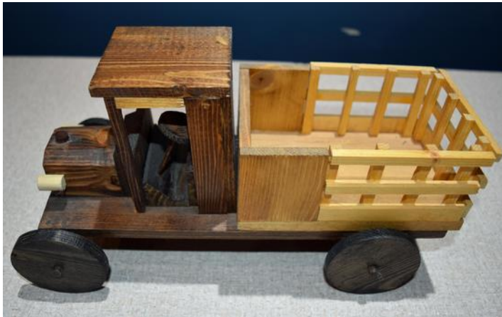
Truck - Bob Bakshis Pine - Poly