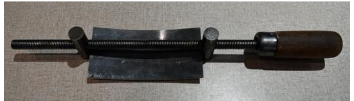
Scraper Holder - Rick Ogren Steel & Wood