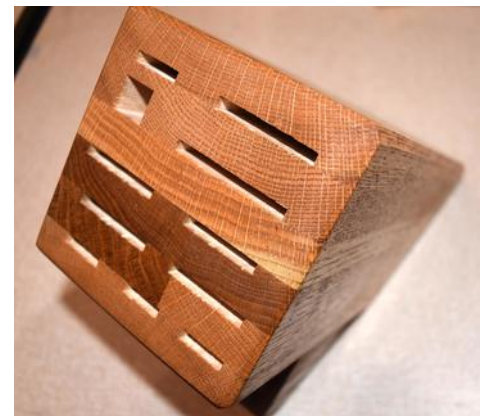
Knife Block - Ken Everett Oak with Walnut Splines - Golden Oak Stain & Poly