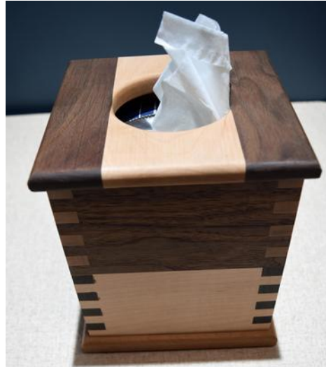
Kleenex Box - Al Cheeks Walnut and Maple - Gel Poly