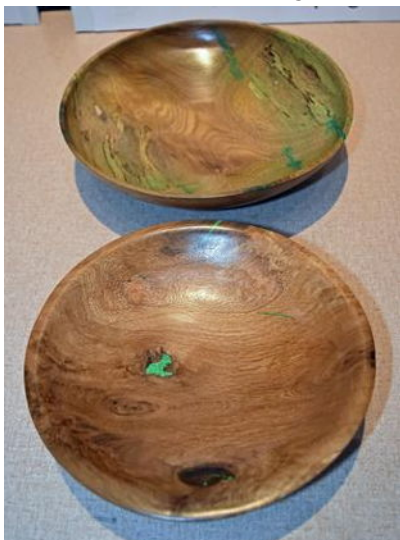
Turned Bowls - George Rodgers Oak - Spray Lacquer