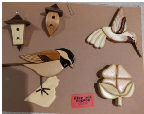
Scroll Saw Projects - Ed Buhot Misc - Spray Poly