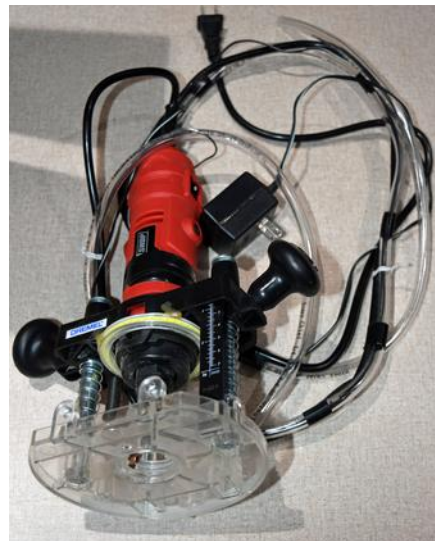
Angel Eye LED Light for Router - Ron Hoppe