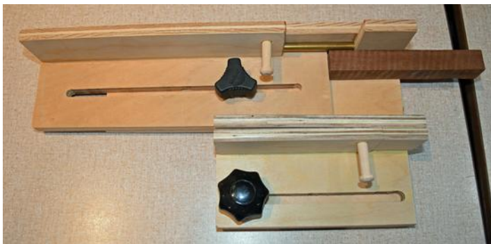
Pen Block Cut-off Jig - Tony Leto Plywood