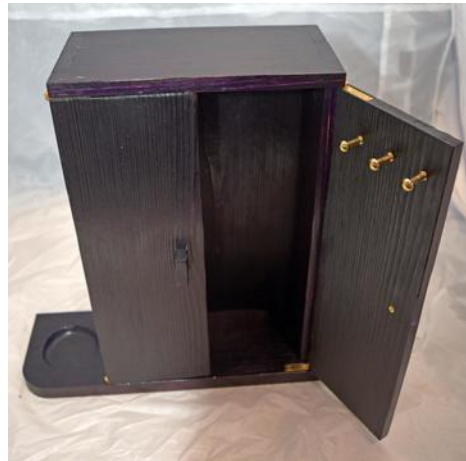
Necklace Case - Zach Belzer Pine - Sugi-Ban-Pigmented Shellac