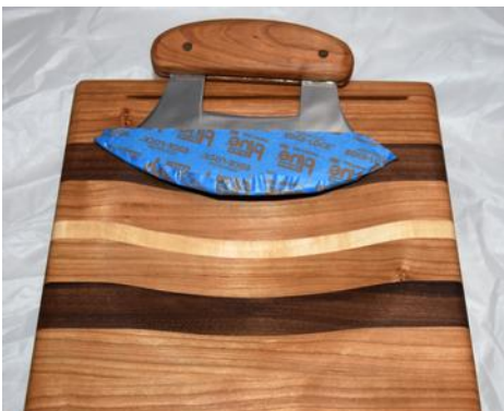
Ulu Knife & Board - Rick Ogren Cherry, Walnut & Maple Mineral Oil