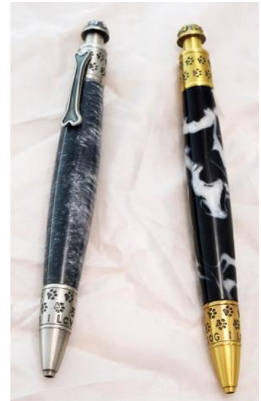
Dog Pens - Tony Leto - Acrylic