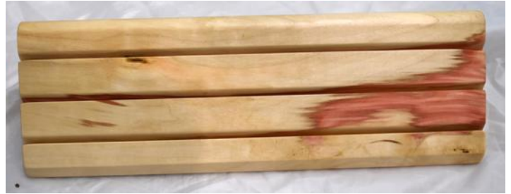
Playing Card Holder - Mike Kalscheur Box Elder - Poly Oil