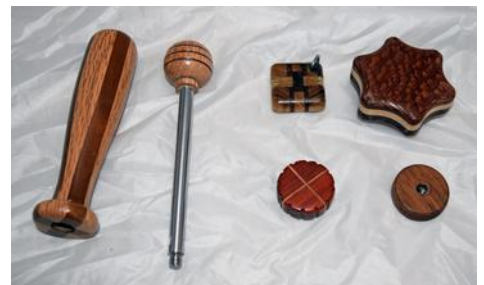
Wood Knobs - O'Brian Parks Scrap