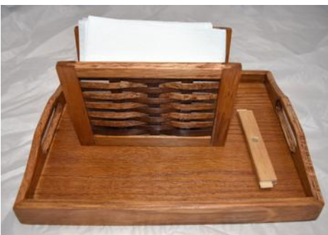
Napkin Holder & Tray Stan Anderson Oak & Walnut - Poly Wipe On

Please do not take your information slips from the "From Our Workshop" tables. We collect them to label our photos!