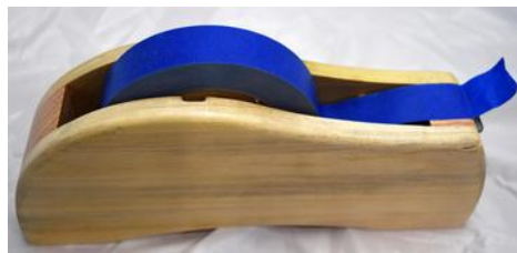
Tape Dispenser - Tom Olson Poplar & Oak - Deft