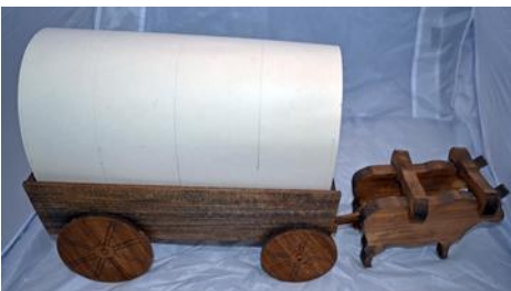
Covered Wagon - Bob Bakshis Pine - Poly