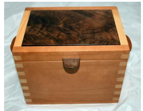
Hinged Box (Beads of Courage) - Mike Kalscheur Cherry, Walnut & Maple - Poly Oil