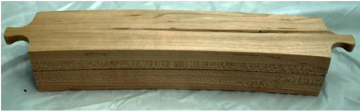
Banana Box - George Rodgers Maple & Walnut - Deft Spray Lacquer