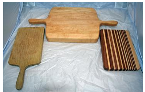
Cutting Boards - Roy Galbreath Maple, Oak & Brazil Cherry - Oil