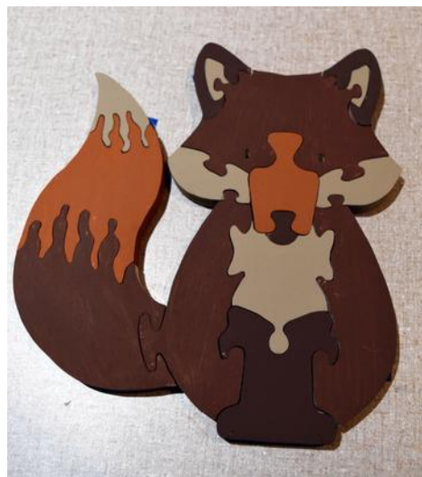
Fox Puzzle - Tom Olson 1/2" Plywood - Paint