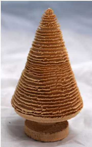
Turned Christmas Tree Rich Rossio