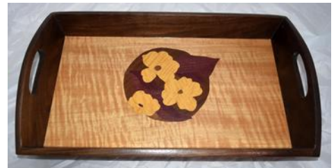
Inlaid Serving Tray Rich Escallier Shellac