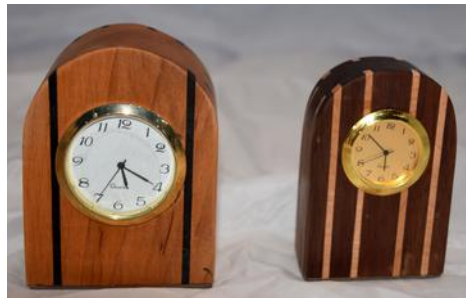
Clocks - Bert Le Loup Black Walnut & Oak - Deft