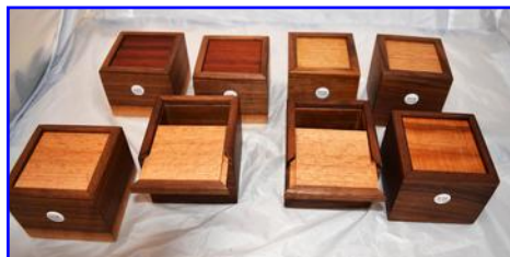
Beads of Courage - Wayne Maier Walnut - Tried & True Oil