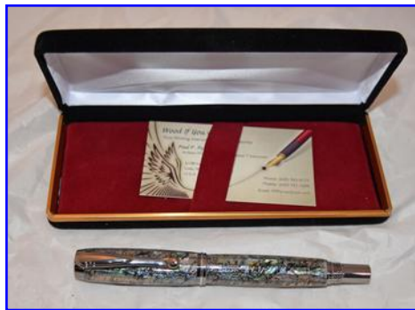
Turned Pen - Paul Pycik Cast Acrylic