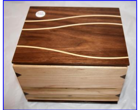
Beads of Courage - Bruce Wick Maple & Walnut - Poly