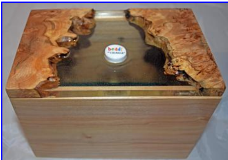
Beads of Courage - George Rodgers Ambrosia, Big Leaf Maple, Epoxy - Poly