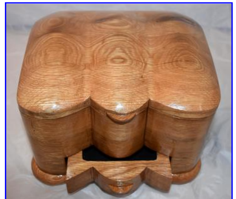
Jewelry Box - Marc Wiener White Oak - Stain & Lacquer