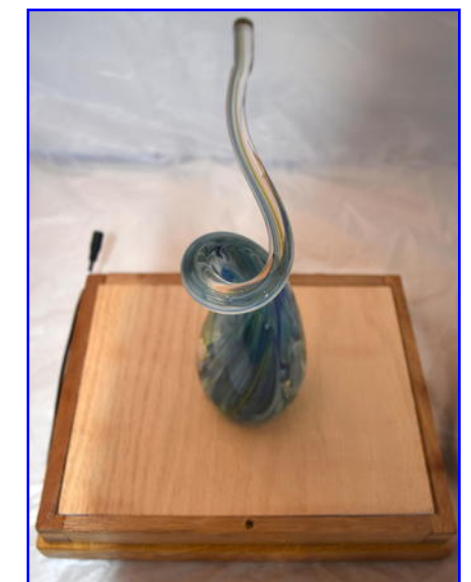
Ornament, Light Box-Keith Rosche Chihuly Glass