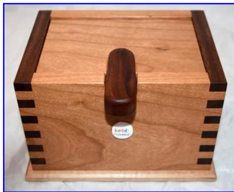
Beads of Courage - Al Cheeks Mahogany & Cherry - Gel Poly Stain