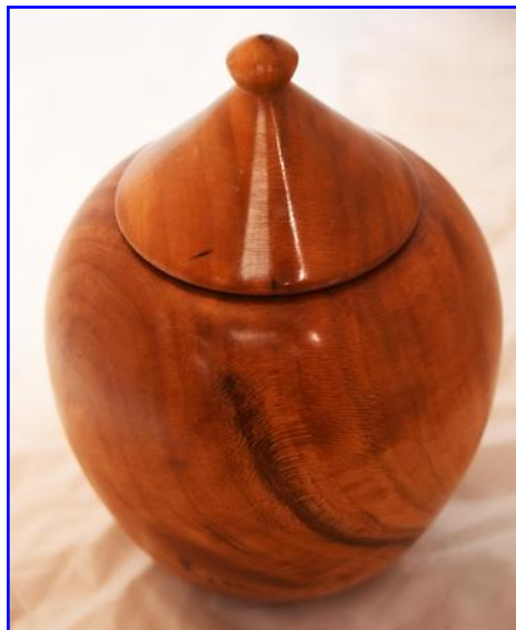
Box - Len Swanson Cherry - Tung Oil & Wax