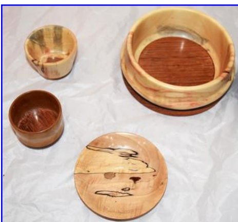
Small Bowls - Roy Galbreath Box Elder & Maple