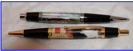
Pens - Tony Leto - Plastic