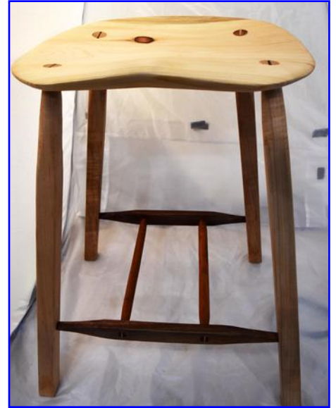
2 Bar Stools - Mike Perry Pine, Maple, Walnut & Cherry - Watco Natural