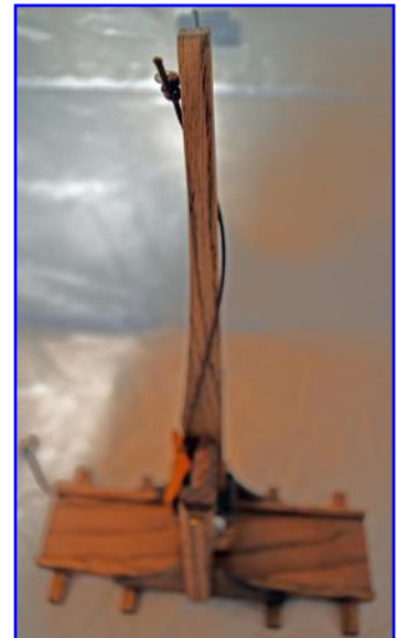
Trebuchet - Bob Bakshis Oak - Poly