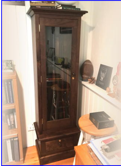
Gun Cabinet - Jim Simnick Solid Walnut - Walnut Stain & Poly