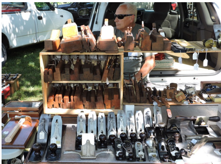
Planes of Every Type and Size