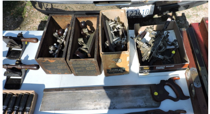
Lots of Stanley 45s and 55s This Year