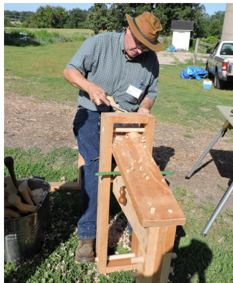
Shave Horse Demonstration