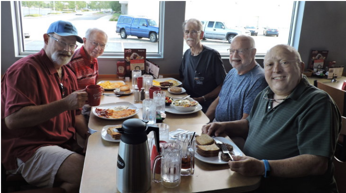
Can't Shop Without Breakfast