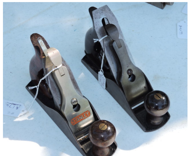
I Call With a Pair of Twos