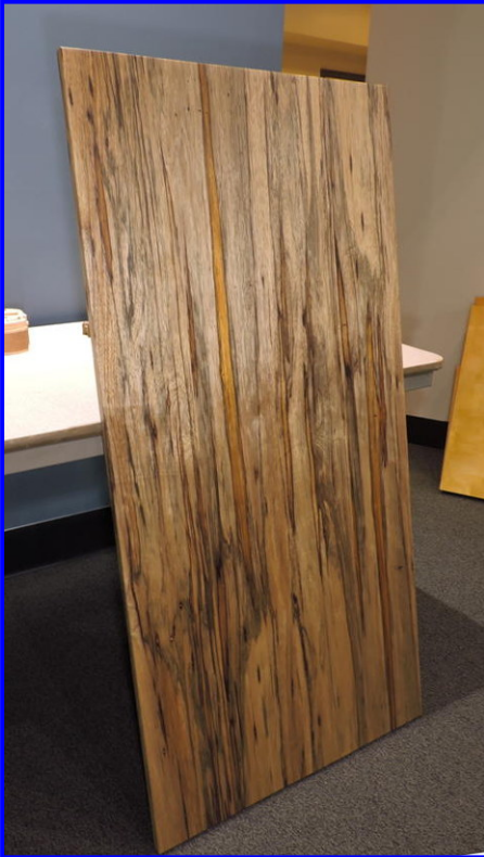
Coffee TableTop - Will Brethauer Black Limba GF Wood Bowl Finish