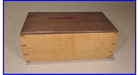
Dovetailed Box - Wayne Maier Canary Wood, Walnut Tried & True