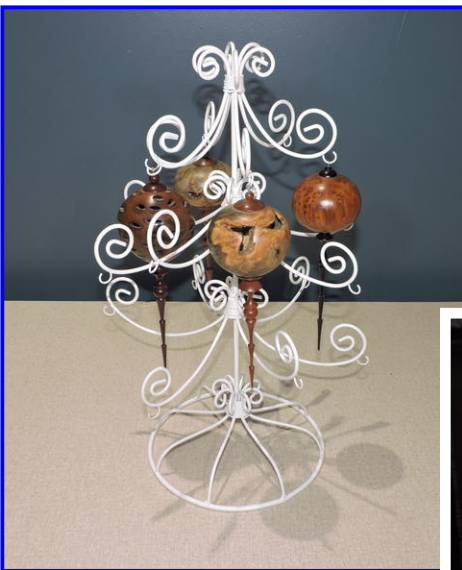
Turned/Hollow ornaments Paul Pycik Burl, Banksia Pod - Deft