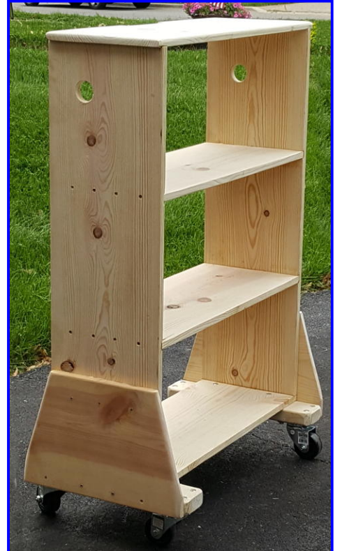
Cabinet - Mark Halla Pine - Plain