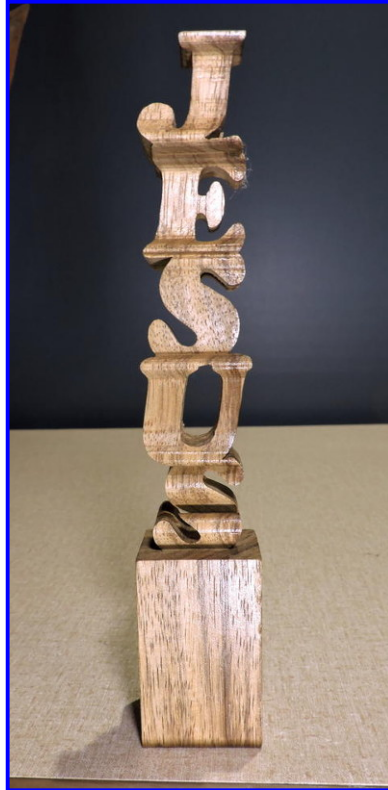
Compound Cut Word Art Will Brethauer Black Limba - Shellac