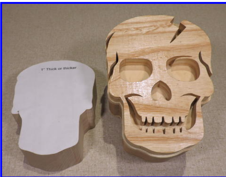
Skull Scroll saw Box Will Brethauer Ash, Alder, Birch Ply - Shellac