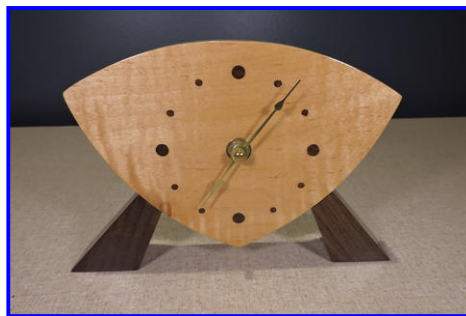
Clock - Ed Buhot Tiger Maple, Walnut - Poly