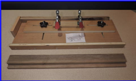
Tapering Jig - Ken Everett Various - None