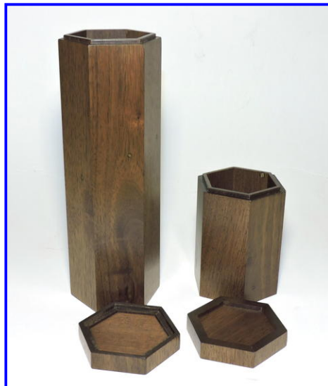
Hexagonal Boxes - Jim Harvey Salvaged Walnut - Watco, Wax