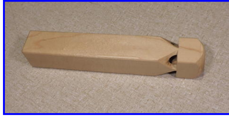
Train Whistle - Roy Galbreath Maple - Spray Poly