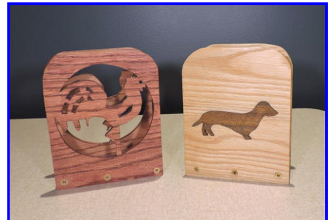
Napkin Holders - Paul Kricensky Oak - Satin Poly