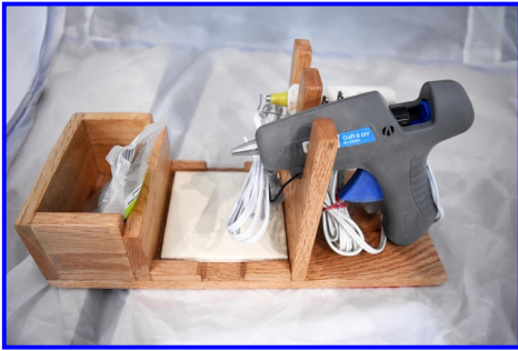
Glue Gun Holder - Paul Kricensky Oak - Poly-Stain