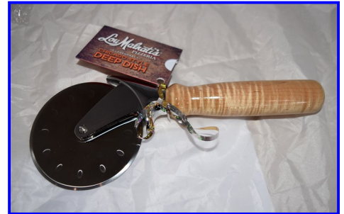
Pizza Cutter - George Rodgers Maple - Yellow Trans Tint/Deft