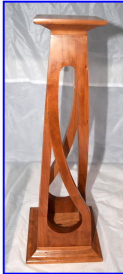
Plant Stand - Kevin Loewe Cherry - Poly-Stain