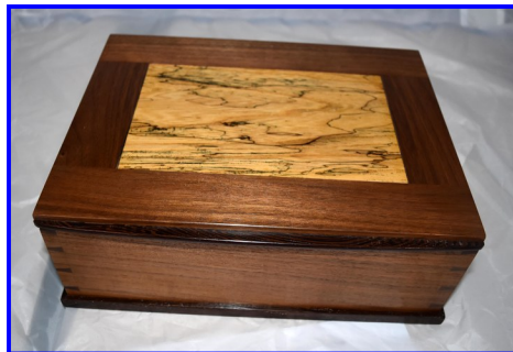
Box - Wayne Maier Walnut - Tried True & Shellac