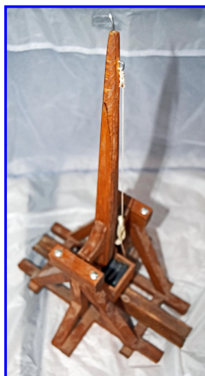
Marble Thrower - O'Brian Parks Scrap