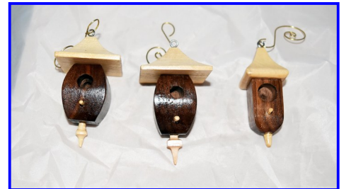
Scroll Saw Bird House - Ed Buhot Walnut & Maple - Spray Poly