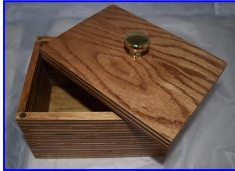
Box - Bob Bakshis Scrap Oak Plywood - Poly