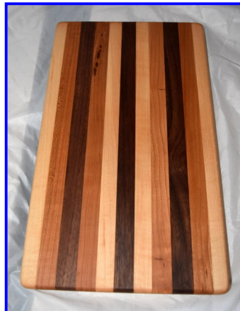
Cutting Board - Mike Kalscheur Maple, Cherry & Walnut - Mineral Oil