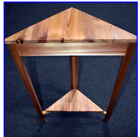
Corner Table - Bill Hoffman Cedar - Shellac