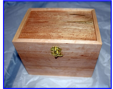
Recipe Box - Lee Nye Birds Eye Maple - Poly & Wax