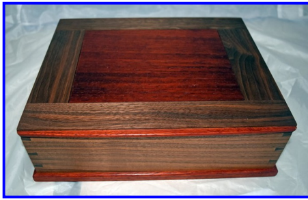
Box - Wayne Maier Walnut - Tried True & Shellac