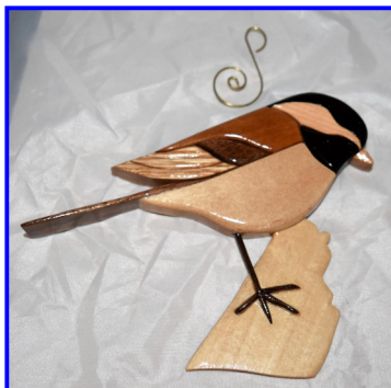
Chickadee - Ed Buhot Many Woods - Spray Poly