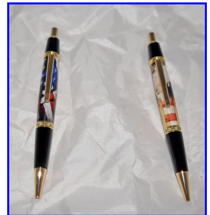
Pens - Tony Leto - Plastic