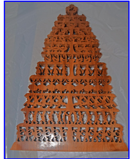
12 Days of Christmas - Roy Galbreath Cherry - Lacquer