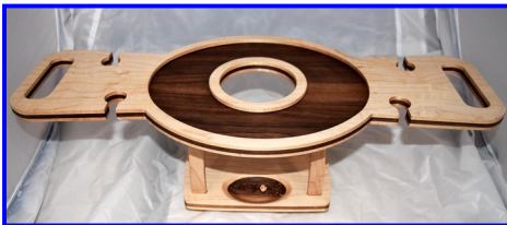
Wine Server - Kevin Loewe Maple/Walnut - Oil/Wax