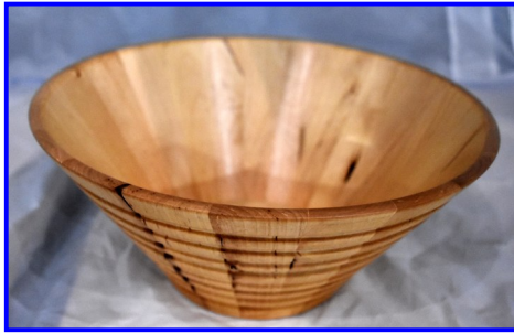
Bowl - Bert LeLoup