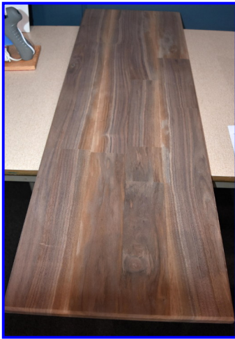
Table Top - Ken Everett Walnut (air dried) - None