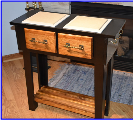
BBQ Table - Tim McAuley Various - Paint & poly