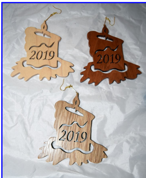
Ornaments - Roy Galbreath Maple, Oak & Brazil Cherry - Spray Poly