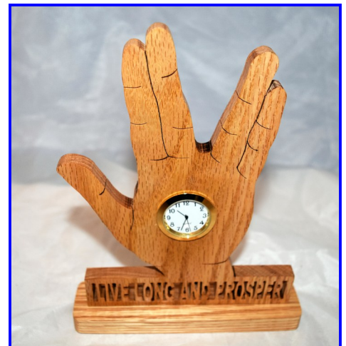
Star Trek Clock - Tom Olson Oak - Shellac