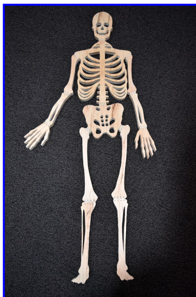
Scroll Saw Skeleton - Will Brethauer Soft Maple - Spar Varnish