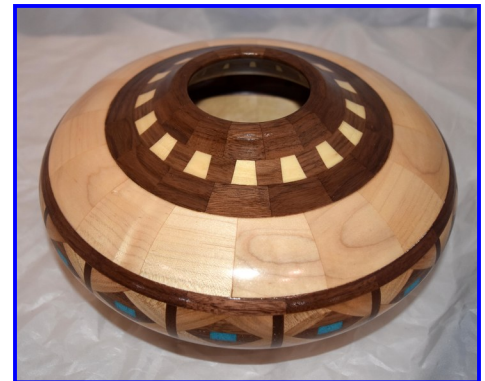
Vase - Jerry Kuffel Ambrosia Maple, Walnut & Turquoise - Lacquer