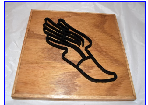
Winged Foot Plaque - Bob Bakshis Oak Plywood - Poly Acrylic