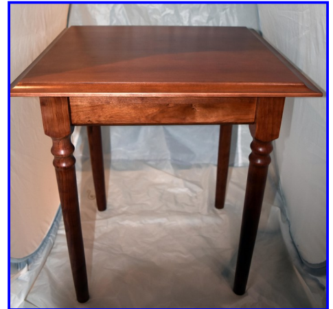
Side Table - Mark Wieting Cherry - Miniwax Stain Lacquer