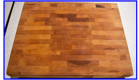
Large End Grain Cutting Board - Bert LeLoup Oak Etc - Butcher Block Oil