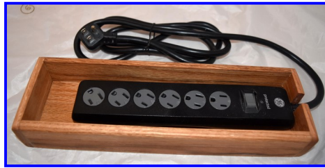
Power Cord Holder - Jeff Kramer Oak - Linseed Oil