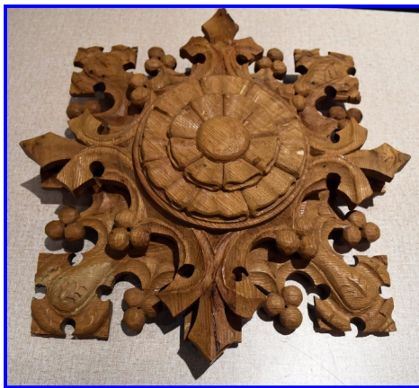
Medieval Boss - Brian Ferguson Oak - Oil