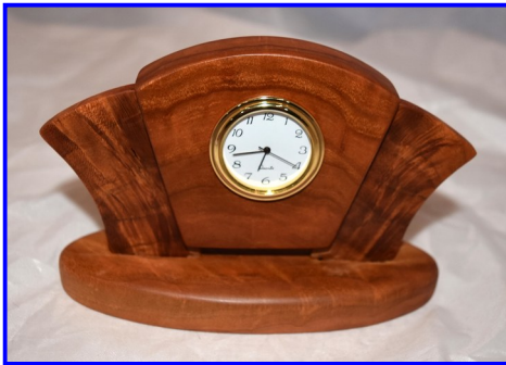
Art Deco Clock - Lee Nye Cherry - Tried & True