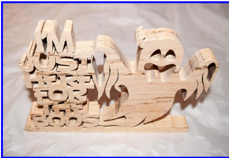
Scroll Saw Art - Will Brethauer Soft Maple