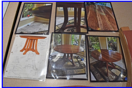
Stickley Repro Table - Jim Simnick Solid Cherry - Bartleys Penn. Cherry Gel Stain /Gen Fin. Poly