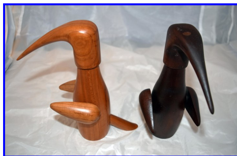
Bird Salt & Pepper Grinders - George Rodgers Cherry & Sapele - Lacquer