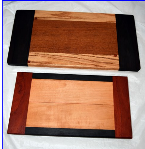
Peter D'Attomo - Cutting Boards Various Woods - Mineral Oil