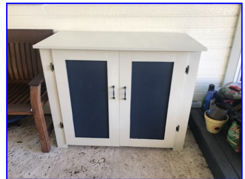
Mark Wieting - Chest Treated Fir - Paint