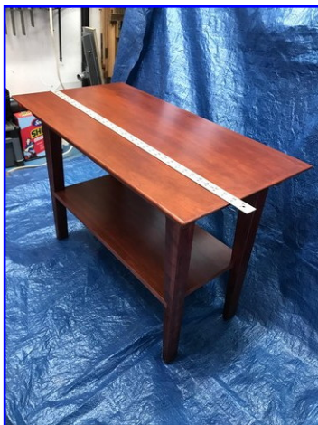
Mark Wieting - Table Cherry - Stain/ Wipeon Poly