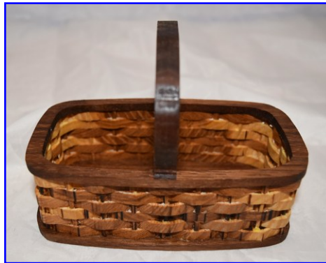
Ken McLaren - Scroll Saw Basket Walnut & Ash - Tung Oil