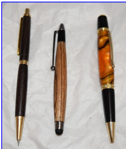
Bert LeLoup - Pens Wood & Acrylic - CA Glue