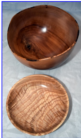
Mike Kalscheur - Bowls Apple & White Ash - Boiled Linseed Oil & Poly