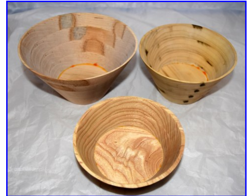
Will Brethauer - Scroll Saw Bowls Soft Maple, Ash & Poplar - General Finish