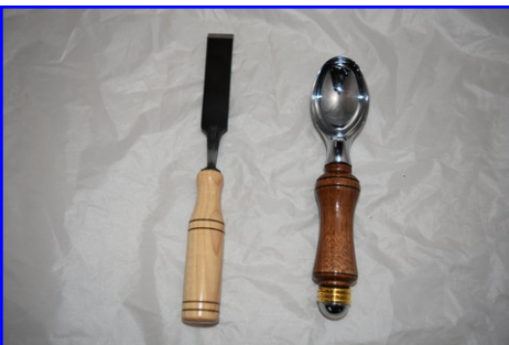
Tom Olson - Chisel Handle & Ice cream Scoop Hickory & Walnut - CA Glue