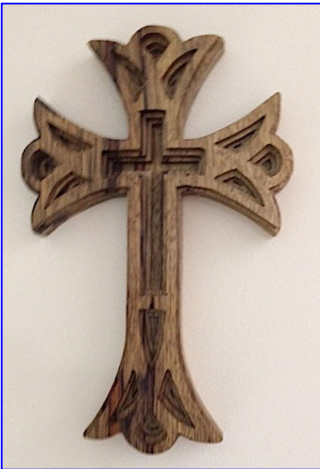
Richard Wilen - Cross Black Limba - Lacquer