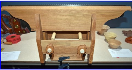
Don Sinnott - Saw Vise White Oak - Teak Oil