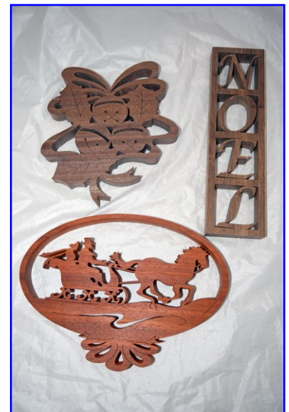
Roy Galbreath - Christmas Scrolls Walnut & Redheart