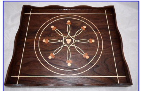
Lee Nye - Inlaid Tea Tray Walnut/Maple Berries & Holly String - Tried & True