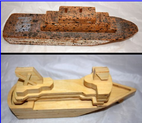
Bob Bakshis Cruise Ship Circa 1979 2X4 & 1X2 Pine - Crayola Cruise Ship Circa 2019 Baltic Birch - Poly