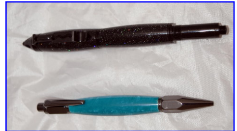
Tony Leto - Pen & Pencil Plastic