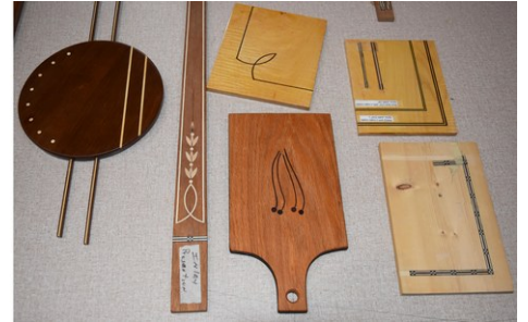
Inlay Samples by Ed Buhot

https://www.dupagewoodworkers.org/gallery/Buhot.html