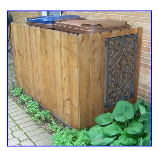
Mike Kalscheur - Refuse Container Garage Cedar, Pressure Treated Pine -Water Seal