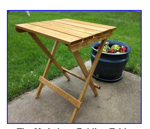
Tim McAuley - Folding Table Red Oak - Poly