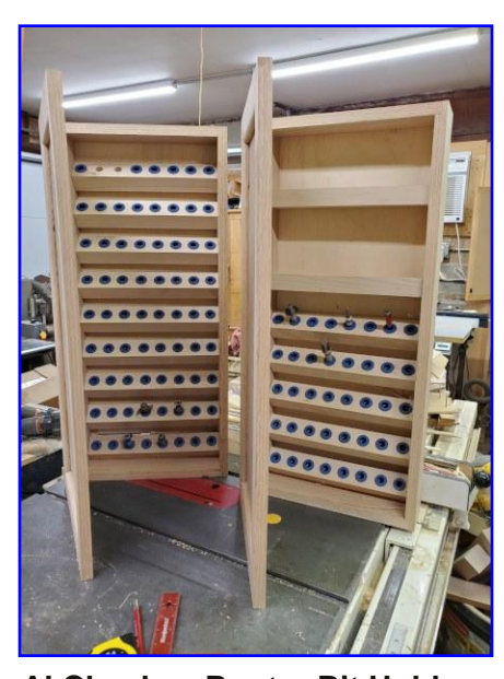
Al Cheeks - Router Bit Holders