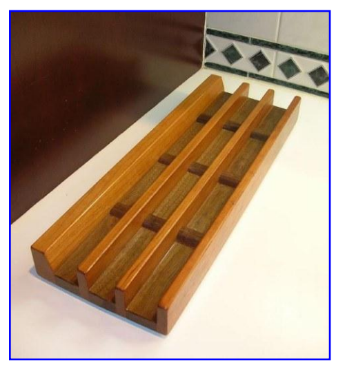
Mike Kalscheur - Cutting Board Holder Walnut, Cherry - Poly