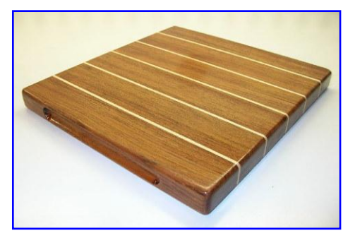
Mike Kalscheur - Cutting Board Jatoba & Maple - Watco Butcher Block Oil