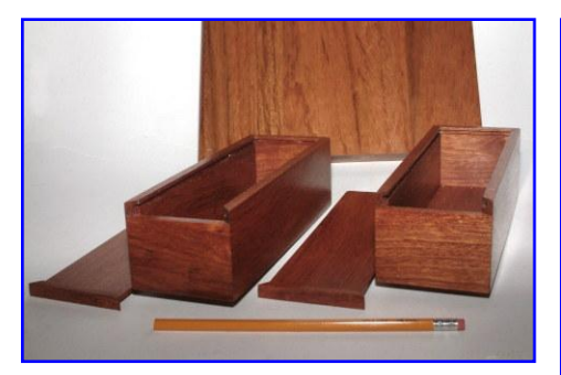
Jim Harvey - Pencil Boxes Salvaged Jatoba - Watco Natural

If you're not connected to the Forum at dupagewoodworkers.org, you can submit photos of your current projects via Google Forms for inclusion in next month's newsletter and our online From Our Workshop.