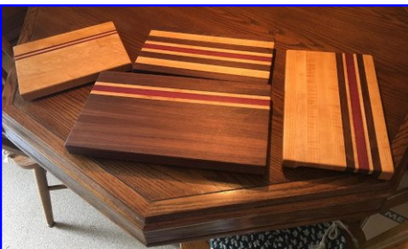
Harry Trainor - Cutting Boards Walnut, Maple, Purpleheart Howards Butcher Block Conditioner