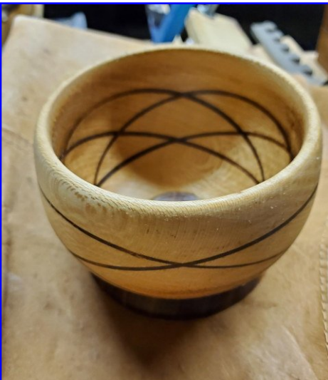
Bert LeLoup - Celtic Knot Bowl Maple, Walnut - No Finish