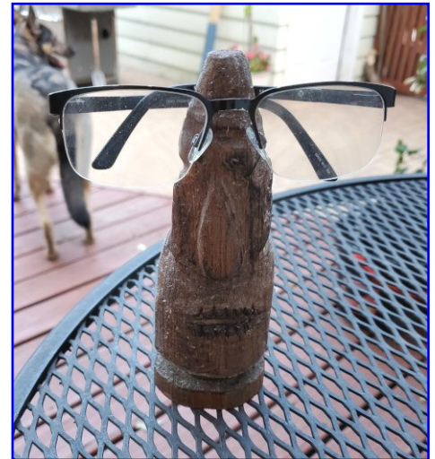
Bert LeLoup - Carved Eyeglass Holder