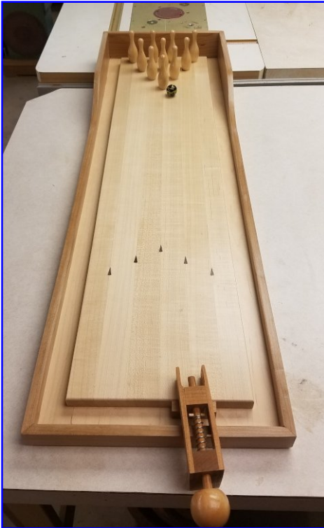
Bill Hochmuth - Bowling Alley Maple, Cherry

If you're not connected to the Forum at dupagewoodworkers.org , you can submit photos of your current projects via Google Forms for inclusion in next month's newsletter and our online From Our Workshop .