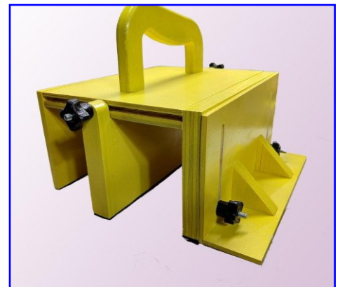
Jerry Kuffel - DIY Gripper Plywood - Spray Paint