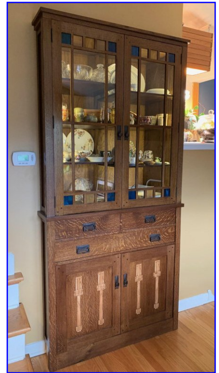
Bill Hoffman - China Cabinet White Oak, Maple, Walnut - Ammonia Fumed and Shellac