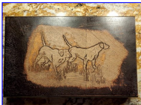
Bert LeLoup - Cigar Box Carving