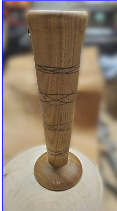
Bert LeLoup - Celtic Knot Vase