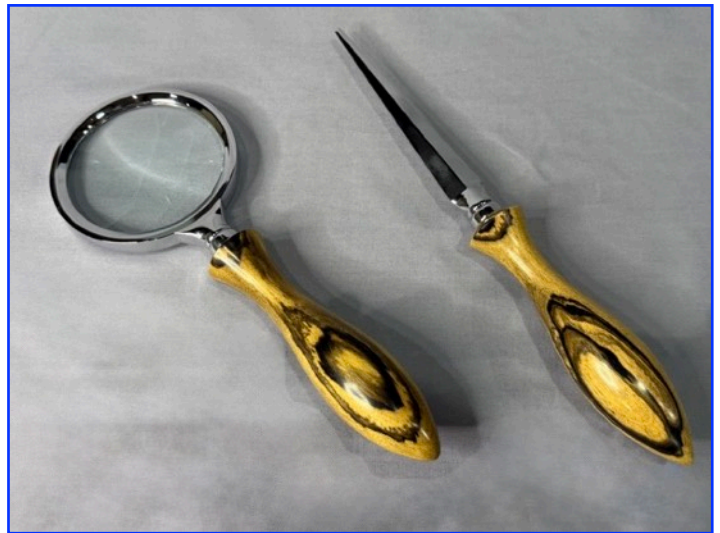
Paul Pyrcik – Turned Desk Set Black & White Ebony – Oil & Wax