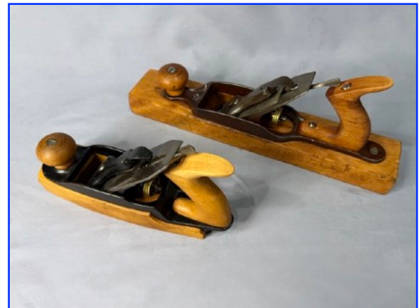
Rick Ogren – Transition Planes Beech – Linseed Oil & Paste Wax