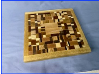
Bert LeLoup – End Grain Cutting Board, Vacuum Chuck, Bottle Stopper & Offset Turning