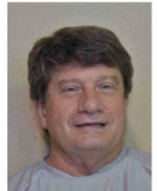
Toys Walter Schmidt